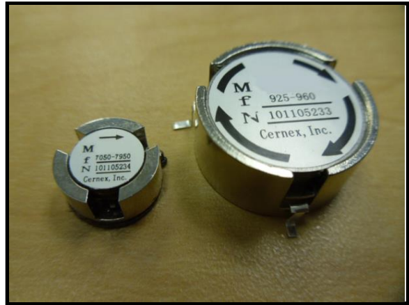
CSC & CSI Series