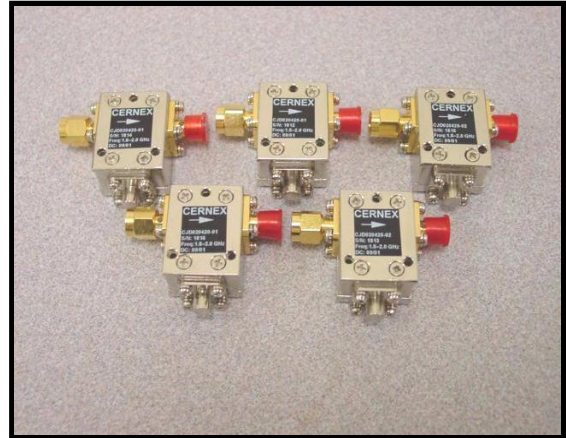
COI & COC Series